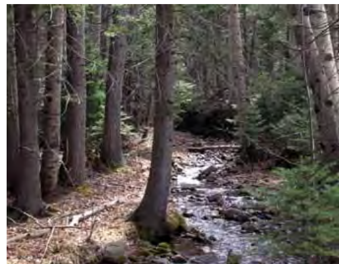
North Brush Creek Tract

As the name implies, North Brush Creek flows through this 157-acre property in the forested foothills of the Sangre de Cristo mountains northwest of Westcliffe. Ponderosa pine forests dominate the property, providing excellent habitat for Abert's squirrels and a wide variety of songbirds. Along the year-round creek Cottonwoods, Aspens and Firs provide sanctuary and travel corridors for other wildlife as well.