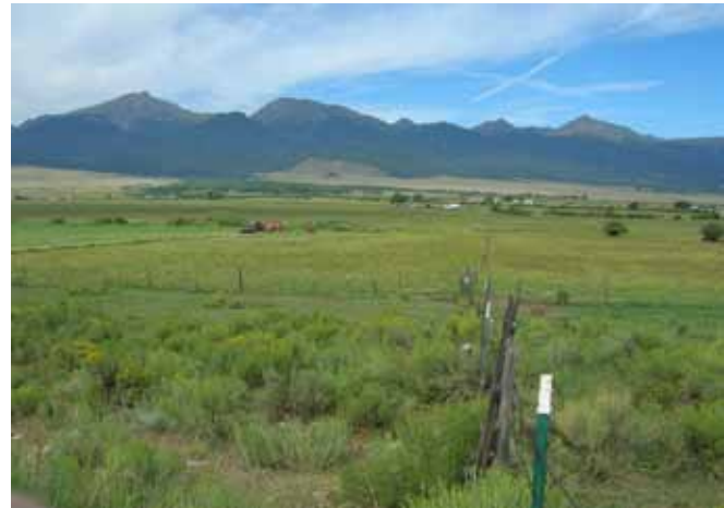
HG Vickerman Ranch

Utilizing funds from Great Outdoors Colorado and the USDA Farm & Ranchland Protection Program, SILPT purchased a conservation easement on the 720-acre HG Vickerman Ranch in December, 2009. The HG Vickerman Ranch has been in continuous agricultural production for over 90 years, during which time the ranch has grown significantly. The ranch lies in the southern Wet Mountain Valley and contains over 300-acres of irrigated hayground along several miles of Grape Creek and Middle and South Colony Creeks. This project continues the conservation momentum in the southern valley floor, which currently represents SILPT's highest-priority area for conservation easements. The HG Vickerman Ranch was one of only a handful of projects in Colorado that met the rigorous standards for GOCO funding this past year.