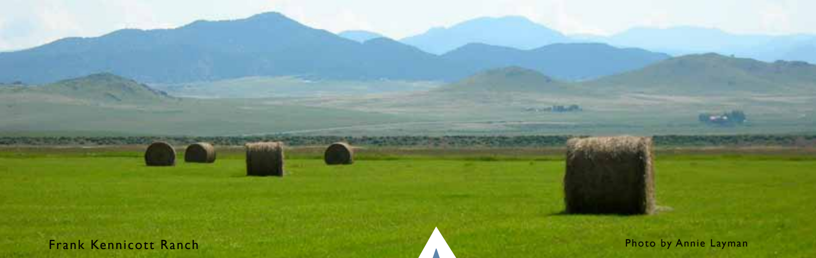
Frank Kennicott Ranch